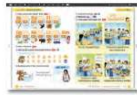
Classroom Presentation Tool